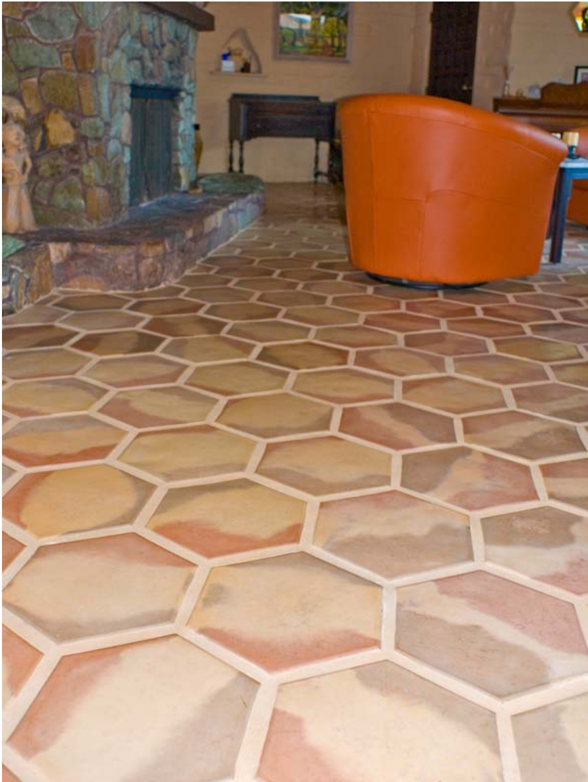
Super Saltillo Hexagon 12x12, Antique French 1, Residence, El Cajon, CA